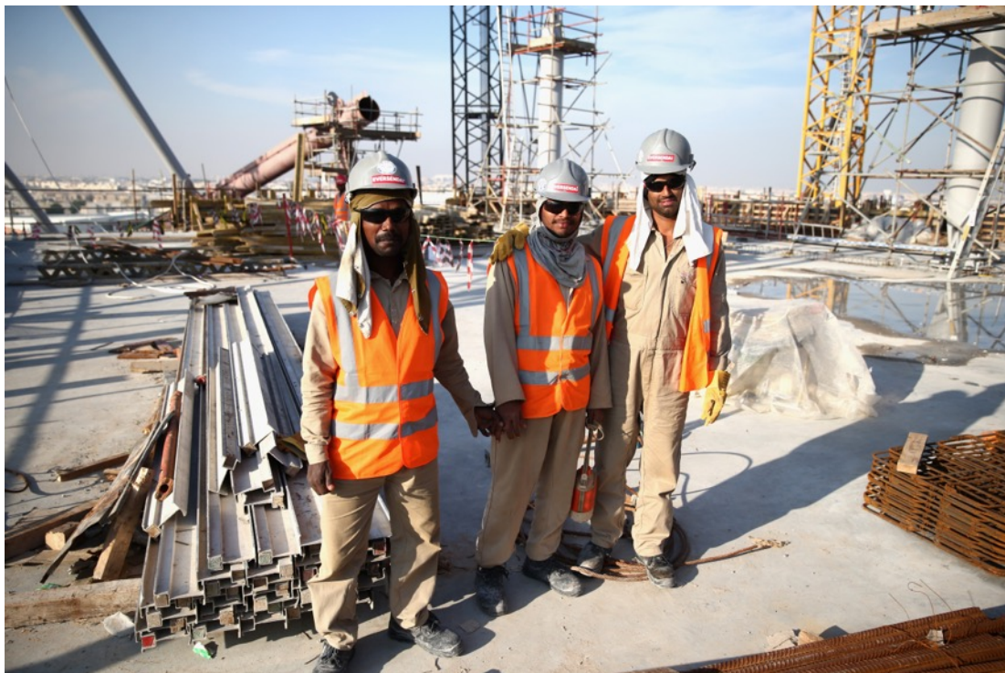
Construction workers in Doha, Qatar, 30 December 2015.

Migrant workers are still unable to form and join trade unions in Qatar, and Joint Committees formed and led by employers, cover only 2% of the workforce. While providing workers with some representation, these remain beset with serious flaws, lacking mechanisms for collective bargaining and failing to provide workers with crucial legal protections. The government must respect its international obligations and allow migrant workers to form and join independent trade unions.