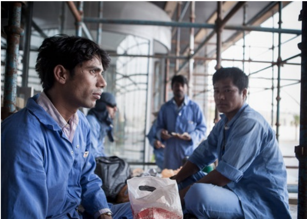
Migrant workers pause to eat at the Sports City area of Doha, Qatar.

A new minimum wage came into force in 2020. Nonetheless, wages in Qatar not only remain low for many migrant workers but are sometimes delayed or not paid at all. This has severe consequences for workers and their families, preventing them from escaping debts incurred from paying recruitment fees, and often trapping them in cycles of abuse and exploitation. A number of initiatives since 2015 have attempted to identify and prevent wage theft, but the issue continues on a significant scale. The authorities should increase and review the minimum wage, strengthen wage protection, and outlaw discriminatory practices of paying different salaries to different nationalities.