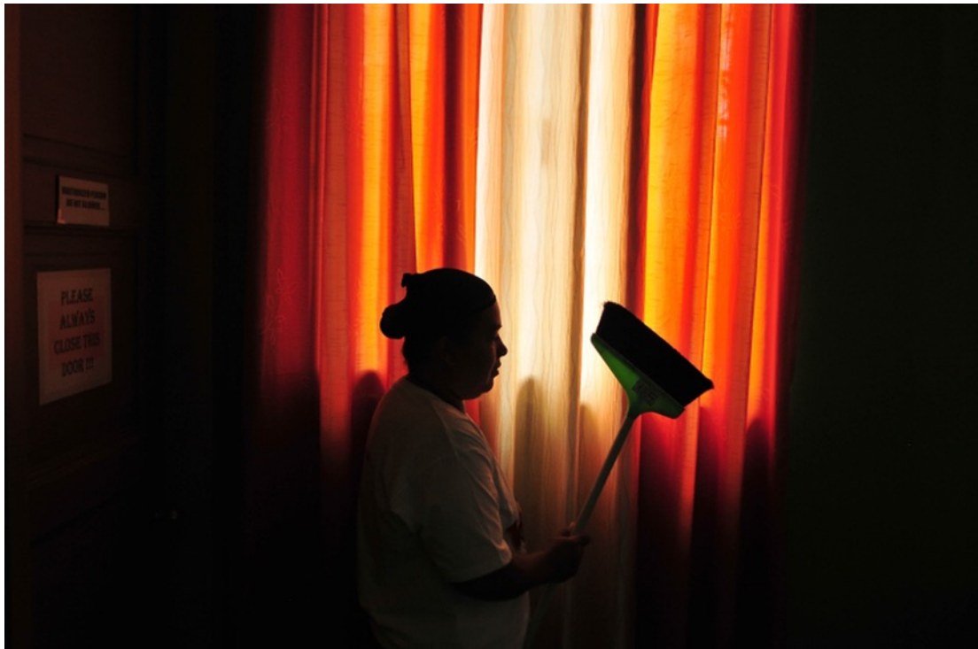
Filipino job applicants undergo an intensive course on housekeeping on September 06, 2013 in Manila, Philippines.

In 2017 the government introduced a new law meant to protect domestic workers. Nonetheless, five years later, Qatar has still not taken effective action to meaningfully tackling their serious and widespread abuse. As a result, this highly vulnerable group – many of whom are women – continue to face some of the harshest working conditions and most serious mistreatment in Qatar, including verbal, physical and sexual assault and denial of rest time. Qatar must immediately increase inspections and sanction abusive employers, offer domestic workers equal legal protection by bringing them under the scope of the Labour Law, and ensure they have access to a safe refuge.