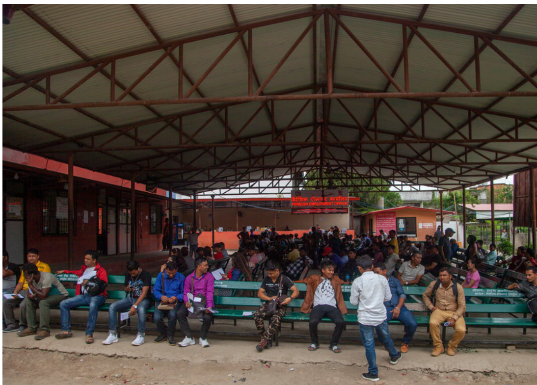
Nepali men wait outside the Foreign Employment Office at Tribhuvan International Airport, in the capital of Nepal, Kathmandu. Many will be prospective migrant workers, bound for the Gulf.

The payment by prospective migrant workers of recruitment fees to secure jobs in Qatar remains rampant, despite Qatar's commitment to tackle the problem. Paying between US$1,000 and US$3,000 in recruitment fees, many workers need months or even years to repay this debt, trapping them in cycles of exploitation and making it difficult for them to challenge or escape abusive employers. Qatar Visa Centres have streamlined the recruitment process in some countries but are not set up to effectively tackle the payment of illegal recruitment fees. The government must work with origin countries to combat such practice and reimburse migrant workers who paid for their jobs in Qatar.