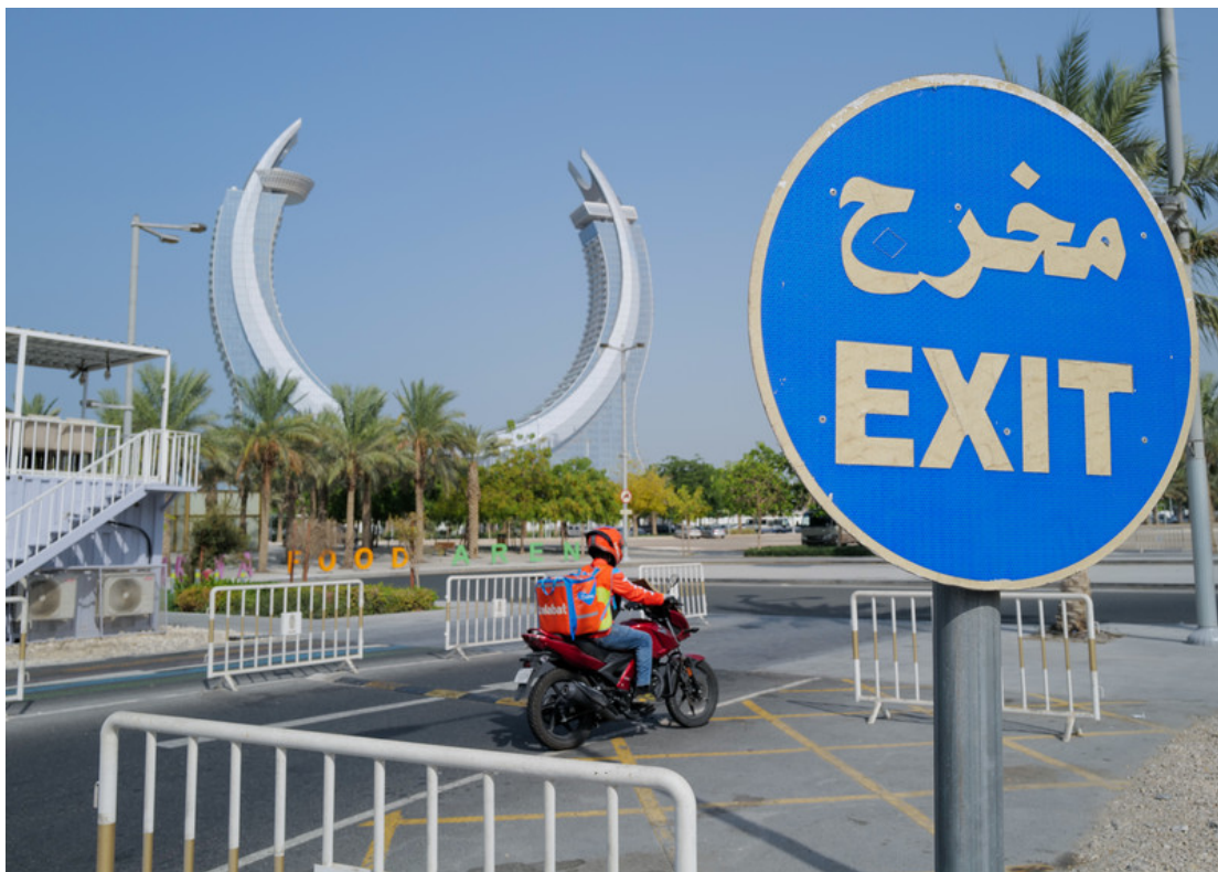
A food delivery worker leaves the Marina Food Area in Lusail City in Doha Qatar, 15 June 2022.

Crucial changes to the inherently abusive kafala sponsorship system mean the vast majority of migrant workers are now legally able to leave the country and change jobs without their employer's permission. While many workers appear to have been able to benefit from these changes in practice, key elements of the system remain in place and continue to trap many migrant workers in exploitative situations, at the mercy of abusive employers. Qatar must remove all these remaining legal and practical barriers, such as the charge of 'absconding', and penalize employers who use such practices as tools of control.