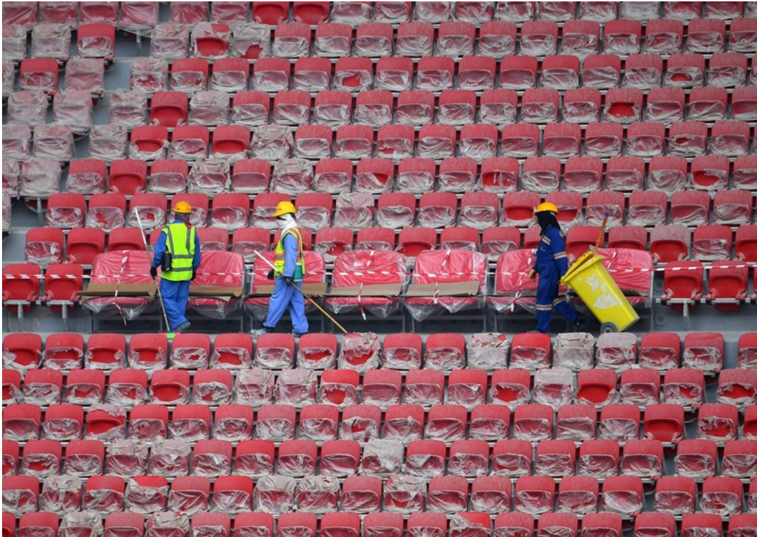
Construction workers in the stands of Qatar's new al-Bayt Stadium in the capital Doha, which will host matches of the FIFA World Cup 2022.

The Workers' Welfare Standards (the Standards) have improved the living and working conditions of thousands of migrant workers falling under the purview of the Supreme Committee, the Qatari body overseeing delivery of the World Cup stadiums. However, some major outstanding issues remain around the extent of enforcement and the small proportion of workers in Qatar covered by the Standards. In addition to strengthening labour laws and enforcement mechanisms, Qatar should learn from and strengthen the Standards and their enforcement, with a view to expand their coverage to more migrant workers across the country.