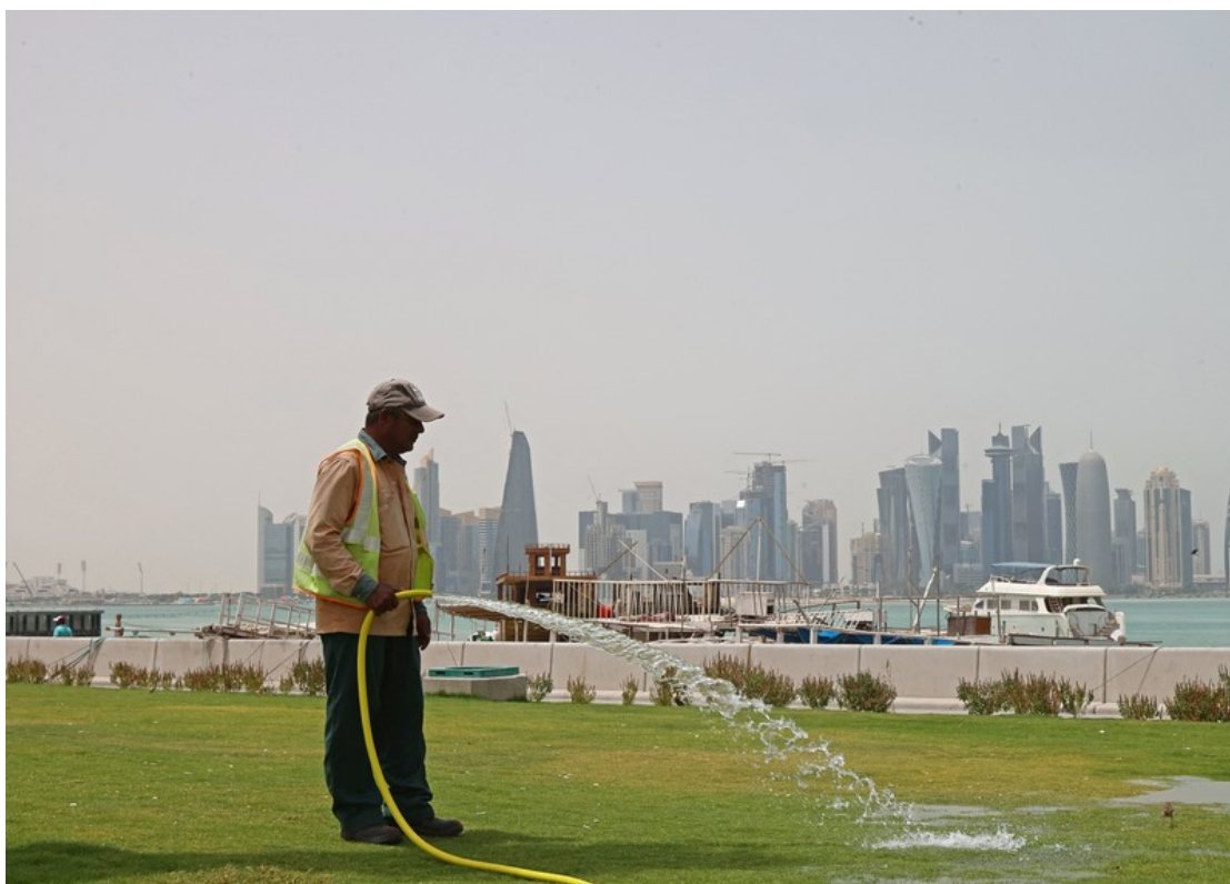
A worker waters the grass in the Qatari capital Doha, on May 5, 2022.

Many migrant workers in Qatar continue to be subjected by their employers to conditions that amount to forced labour, including those in private security or domestic work. This includes workers being repeatedly denied their rest days and forced to work under the threat of financial penalties, having their salaries arbitrarily deducted and sometimes their passports confiscated. Yet despite the severity of this abuse the government continues to take insufficient action. Qatar should train inspectors to detect forced labour practices, investigate such cases to hold abusive employers to account, and remedy victims.