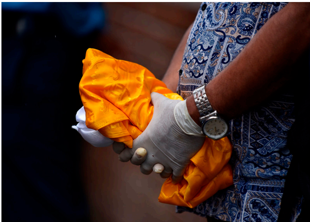
A Family member arrives at Tribhuvan International Airport to take a relative's deceased body for the final ritual in Kathmandu, Nepal on Friday, June 19, 2020.

Migrant workers continue to face major challenges to receive justice and remedy for a range of abuses despite new mechanisms introduced. New Labour Committees increased the number of workers successfully resolving complaints of wage theft but remain beset with shortcomings and delays. A compensation fund has also started to pay out significant amounts to workers offering them much needed relief but is not accessible to all and the amounts paid out have been capped. Qatar must increase the number of judges, accept collective, historic and remote claims and ensure the fund reimburses workers their full dues. It should also ensure migrant workers can access remedy for non-wage related abuses.